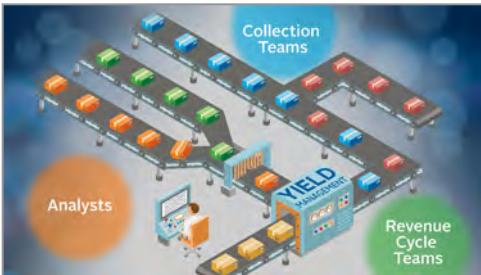
▲ Yield Management