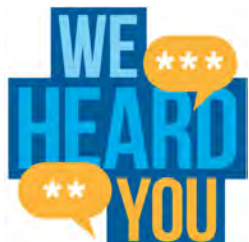
▶ Program Logo