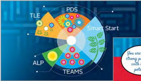
▲ Talent Philosophy