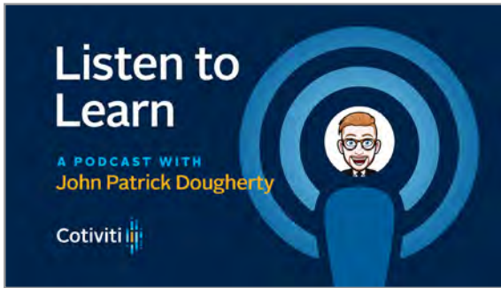
▲ Educational Podcasts