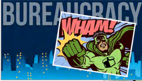
▲ Agile: OKR's in Practice