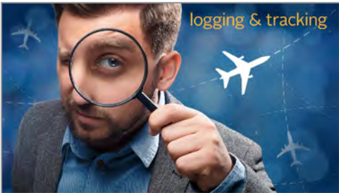
▲ Travel Safety