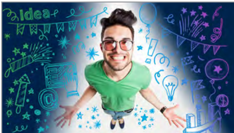
▲ Solutions-Driven Results